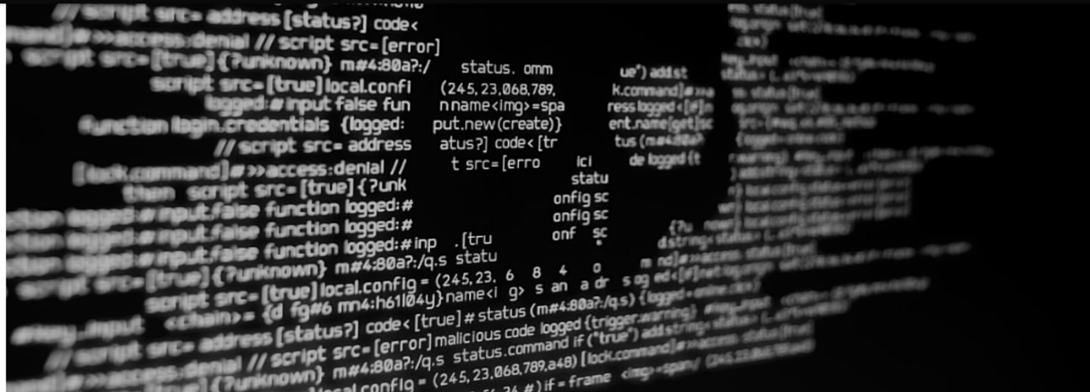
Cybersecurity Ventures Official Annual Cybercrime Report.